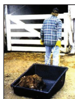
Kozy Kalf Sled