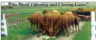
Drive-Thru Electric Gate