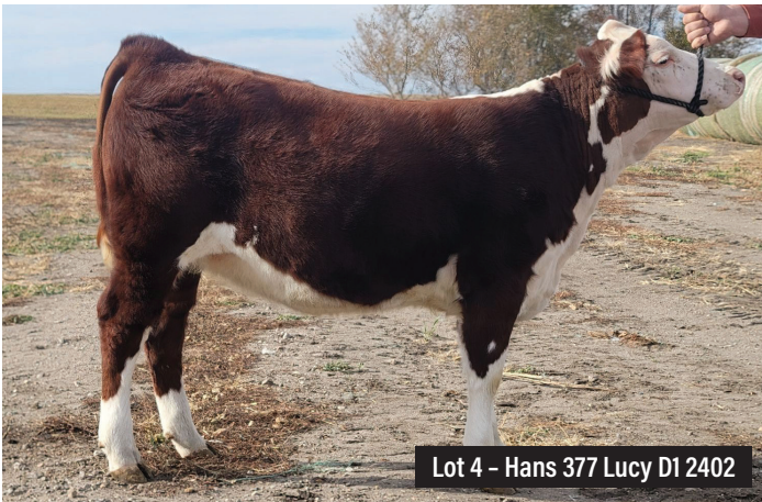
Lot 4 - Hans 377 Lucy D1 2402

CE: 7.9 BW: -0.1 WW: 56 YW: 89 Milk: 28 REA: 0.37