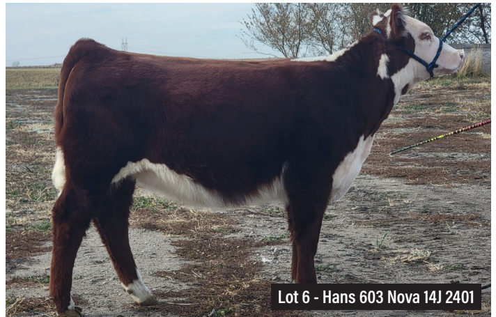
Lot 6 - Hans 603 Nova 14J 2401

CE: 7.5 BW: 2.3 WW: 66 YW: 97 Milk: 37 REA: 0.37